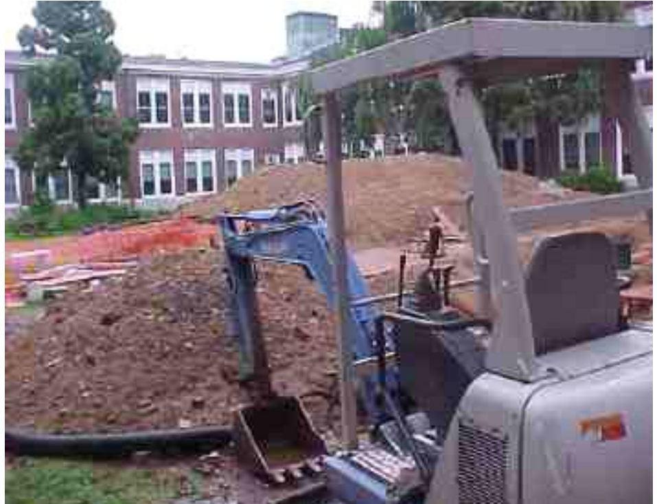
This picture of a backhoe inside the high school's quadrangle is representative of all the construction work done throughout the district this summer.